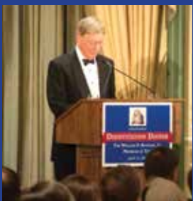
George Will headlined our inaugural Disinvitation Dinner in April 2015.