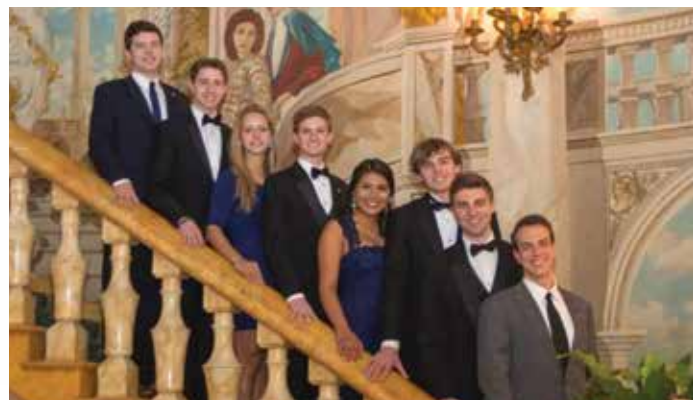
The 2015 Student Board

The entire event can be viewed on our website. The panel discussions may also be viewed on C-SPAN.