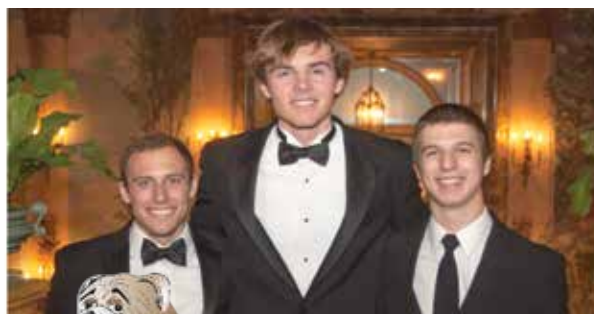
Buckley Fellows at the inaugural Disinvitation Dinner.