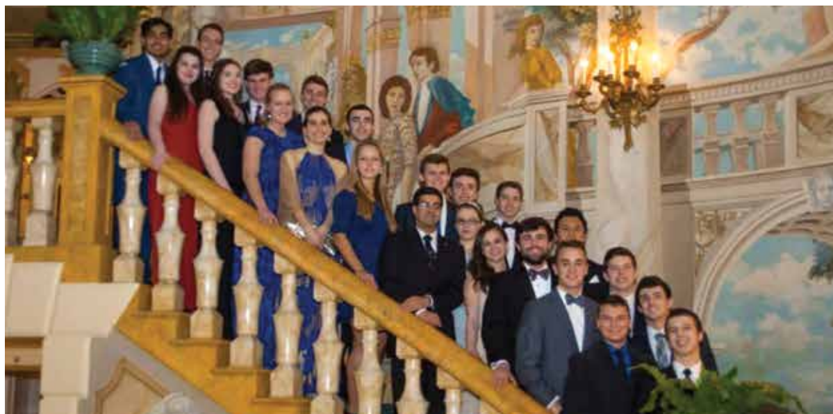
Buckley Fellows at the inaugural Disinvitation Dinner.