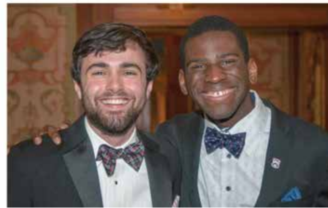
Buckley Fellows at the Disinvitation Dinner.

Our student blog launched last year, The Beacon, includes commentary from Buckley Program student fellows, essay contest winners, and interviews with guest speakers. The Program's student fellows interviewed guests including Andrew McCarthy, Richard Brookhiser, Michael Auslin, Jim DeMint, Jason Riley, Carlos Eire, and Christina Hoff Sommers.