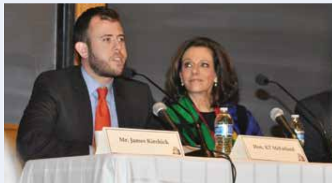
The third panel of our fall 2014 conference.