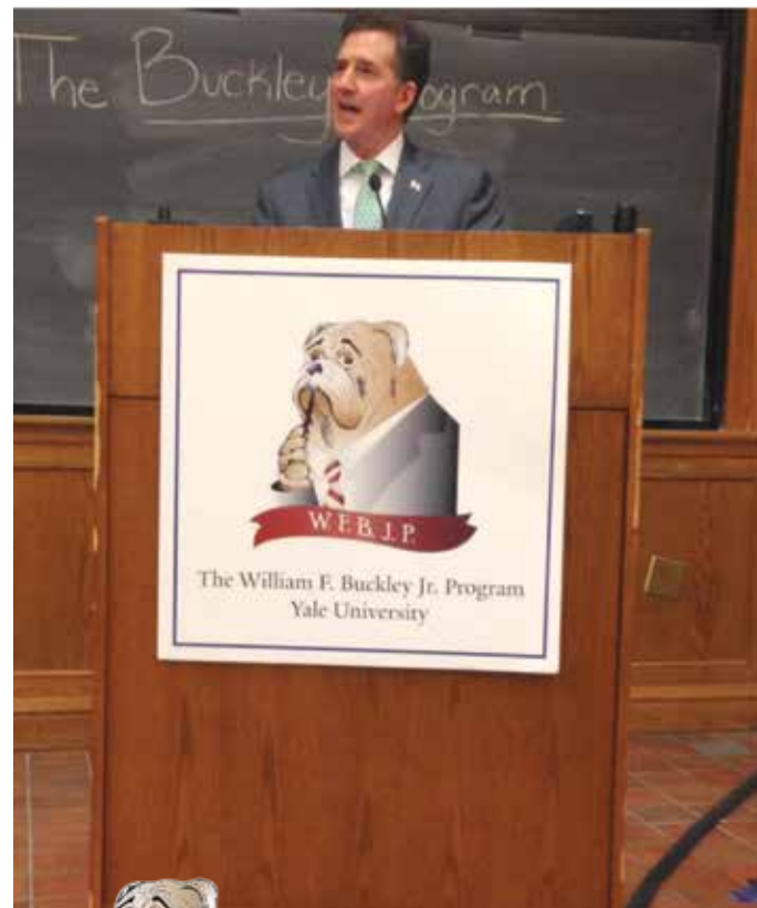
Heritage Foundation President Jim DeMint joined us on campus to give a talk in March 2015.

On Saturday, February 27th, the Buckley Program will host a 50 th Anniversary Celebration of Firing Line , the television show Bill Buckley launched in 1966. Further details will be announced as the date approaches.