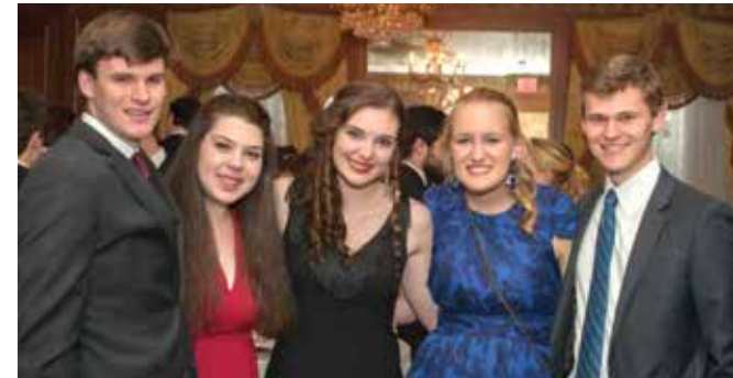
Buckley Fellows at the Disinvitation Dinner.

In the 2014-2015 academic year, the number of student fellows grew to 120. Through this program, Yale students get the opportunity to meet with guest speakers over a meal, receive free books, and attend conferences. In February, for example, we sponsored five Buckley fellows attending the Conservative Political Action Conference. In April, dozens of Buckley fellows attended the inaugural Disinvitation Dinner in New York City.