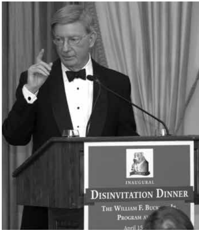
George Will at the Disinvitation Dinner.

So long as speakers continue to be disinvited, you can count on the Buckley Program to re-invite them, and we hope you’ll be able to join us for next year’s Disinvitation Dinner. Please stay tuned for details.