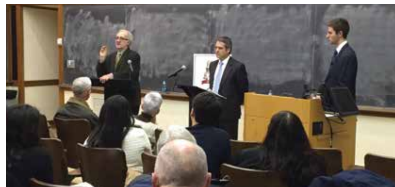
Our Firing Line Debate on Conceding Castro's Cuba: A Productive Partnership or a Capitulation to Authoritarianism?

This past academic year, the Buckley Program hosted seventeen events, including lectures, Firing Line debates, and seminars.