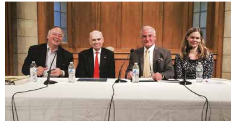
Speakers at our panel discussion on Barry Goldwater, the 1964 Election, and A Time for Choosing: 50 Years Later.