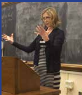
Christina Hoff Sommers spoke at a Buckley Program event in January 2015.

111 Whitney Avenue New Haven, CT 06510 www.buckleyprogram.com